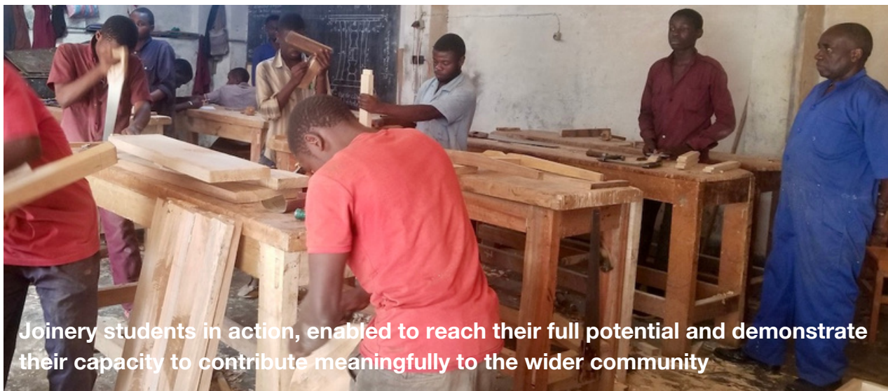
Joinery students in action, enabled to reach their full potential and demonstrate their capacity to contribute meaningfully to the wider community

I am 19 years old and the fifth child in my very poor family. I am so happy to have finished my training because now I can make chairs, beds, tables, cupboards and more. When I leave the centre, I plan to join with other workers to open a large, cooperative joinery, where we will share the monthly income. I want to save my money to help my parents, buy clothing and look for a family house ready for when I can get married. I don't want to waste my money and I am determined to abstain from alcoholism and other harmful pursuits. Thank you for helping me gain the skills so I can prepare for my future.