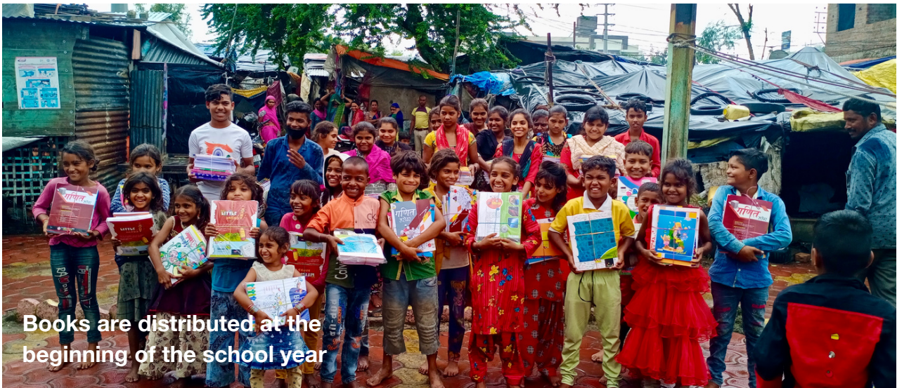
Books are distributed at the beginning of the school year

I am very grateful that I have been given a meaningful direction for my life. I am working hard to finish my education so that I can achieve great things in my life and for my family.