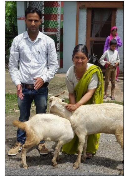
Recipient of a pair of goats.

The project began in April 2016, with a survey of eight villages. From these eight villages, an initial 22 widows were selected to participate in the program. Another 18 widows were brought in after six months, to allow time for learning and adjustments in the program. All 40 women are the poorest of the poor, with no income of their own and have been subjected to abuse from the community. Many of them are blamed for the death of their husband and seen as a curse.