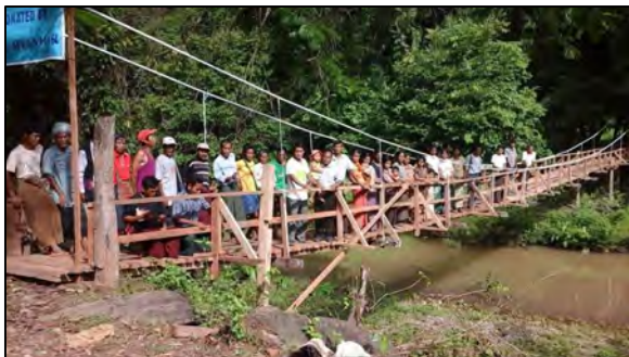
At the opening of the new bridge – there is no way the old one would have held all those people!

The bridge is the main link between two different township areas – Matupi and Palewa. In one is Sami Town which has a middle school and high school as well as medical services. In the other is 12 villages. These were regularly cut off from everything during the monsoon season when the river was uncrossable using the old bridge. Children were expelled from school for lack of attendance, and people died from lack of access to emergency medical care.