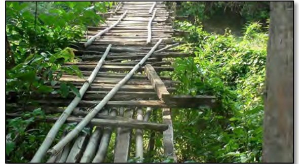
The old bridge

In May 2015 funds were sent over to Myanmar to rebuild an extremely dilapidated rope bridge linking a number of villages to a larger town. The bridge was rebuilt, with the villagers contributing labour and part of the cost. In August Chin state had massive floods, and a large amount of infrastructure was washed away. But our bridge stayed! Now, nearly a year since the bridge was finished, we are writing to share with you the impact it has had on the region.